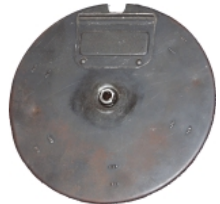
BOX AND DRUM MAGASINE FOUND WITH S/N 5518