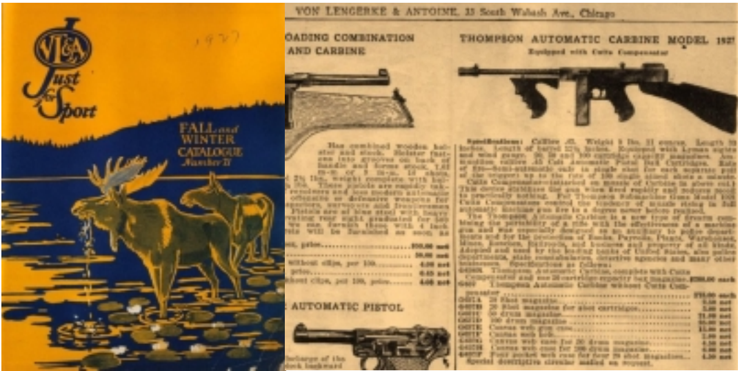
LEFT IS AN EXAMPLE THE VL&A CATALOG FROM 1927.

Inspecting the rear lower area where the original serial number was also ground off, Mike and I were surprised when we removed the rear stock to find a hand stamped number 11573.