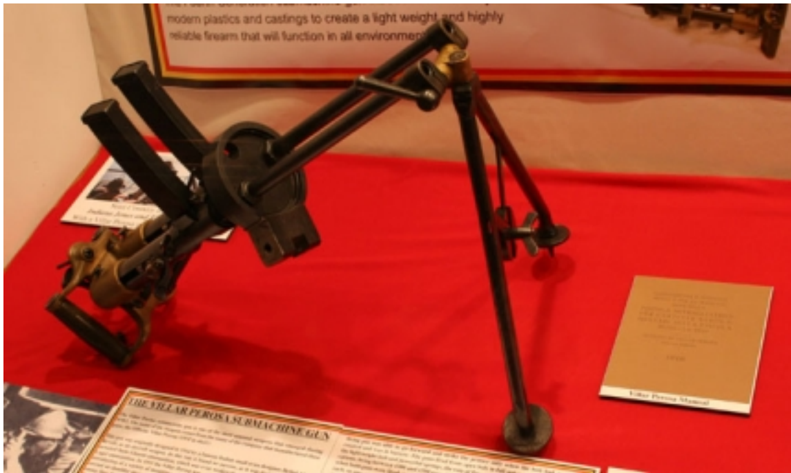
THE VILLAR PEROSA