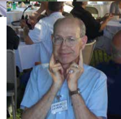
WHO HAS THE BEST HAPPY FACE?