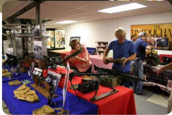
(BELOW) CAN YOU TELL WHO IS THE REAL OWNER?