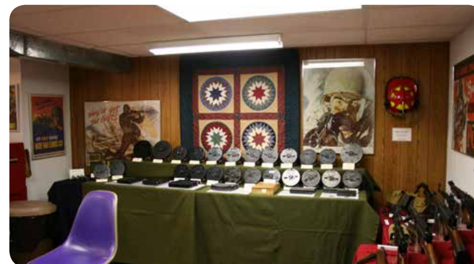
GOOD FRIENDS, GOOD CONVERSATION AND GREAT DISPLAYS! THE ROOM WAS PACKED!